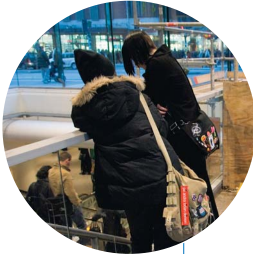
Shoplifting at Ählens, two teenagers have stolen make-up. Their parents come to pick them up.

The role of a police officer is varied and diverse. There is no such thing as a "normal" day, but a uniformed police officer in Stockholm County might encounter the following events, in this case at Norrmalm police station.