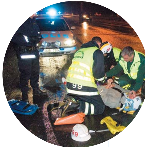
Traffic accident between a car and a cyclist. The cyclist is injured and taken to St Görans Hospital. The patrol goes to the hospital.